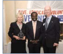
We celebrated the innovative and compassionate work of the University at Albany's School of Social Welfare. with our Community Impact Award.