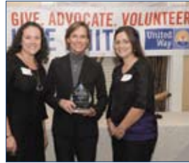
We recognized the efforts of the Business Review in enhancing education and the workforce with our Advocacy Award.