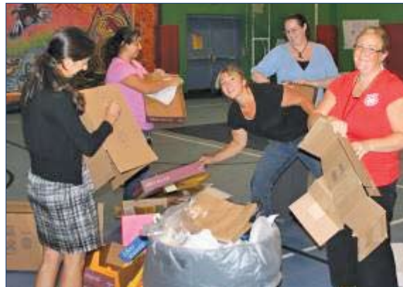
United Way Young Leaders sorting school supplies at the Mechanicville Area Community Services Center.

This past year, Young Leaders engaged in activities including helping with the Mechanicville Area Community Services Center's annual school supply drive, giving their time on United in Action projects and "singing" in the Saratoga Chamber of Commerce's Lip Dub video!