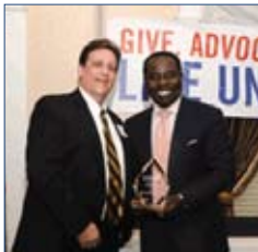
We thanked WVCB - Siena College Radio for their support of the 2-1-1 information and referral service with our Media Partner Award.