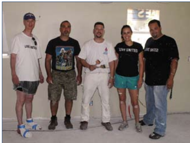
Our friends in organized labor provided invaluable assistance to residents in many parts of the greater Capital Region following the devastation of Hurricane Irene and Tropical Storm Lee. In June 2012, United Way staff and union members worked together to repair and paint homes that had been damaged in the Town of Schoharie.

Since 2011, United Way of the Greater Capital Region has also provided the Emergency Labor Assistance Program (ELAP). ELAP provides immediate, emergency funding for union members who are dealing with crises, such as home fires, family illness or personal injury. ELAP came about after several years of careful coordination and planning by United Way's board in conjunction with local labor leadership.